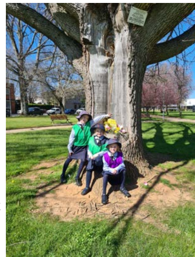
The Queen's Coronation tree