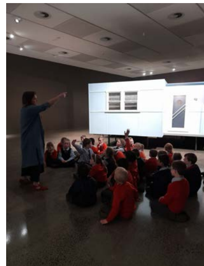
Learning about the artist's inspiration