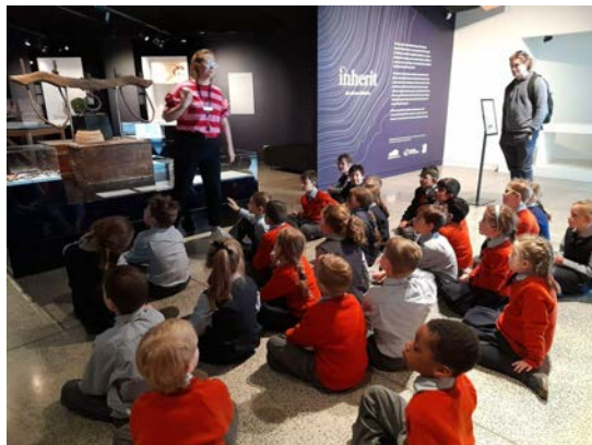
Learning about the artefacts found in the museum