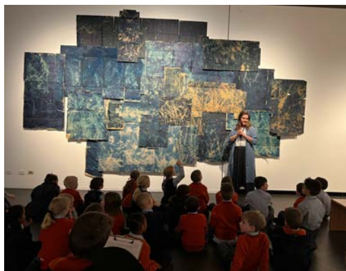
Enjoying viewing artworks in the Gallery