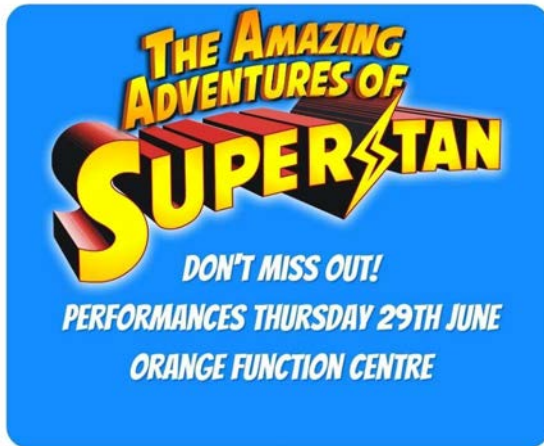
Superstan - HELP Wanted